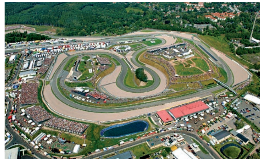
Sachsenring from the air

Motor bike racing GP in Sachsenring – Hohenstein-Ernstthal – www.sachsenringgp.de