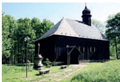
Author: R. Sedláček

The church in the border village of Český Jiřetín is the only all-wooden church in the Ore Mountains. The church was built in the second half of the 17 th century in the village of Fláje where it remained until 1969. During the construction of the Fláje dam the church was the only saved structure in the flooded village and moved to the nearby Český Jiřetín. An interesting fact is that in 1999 the church bell tower was equipped with a bell which originally came from a church in the village of Klíny. Today, you may see an exhibition in the church, focusing on the history of border villages or you may visit a concert of children's choirs, which is held there before Christmas.