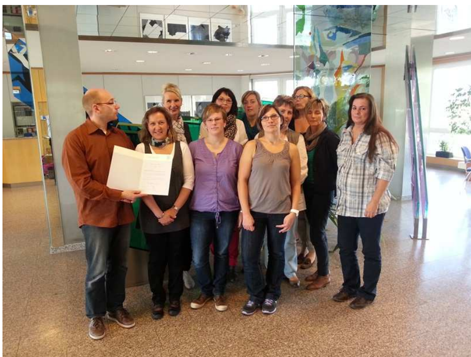
The fresh examinees

Building up on the experiences of this course we are now planning to hold a similar one in the rural district Greiz. There the demographic and medical service preconditions are comparable with the Kyffhaeuser district.