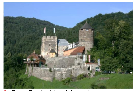
Burg Deutschlandsberg