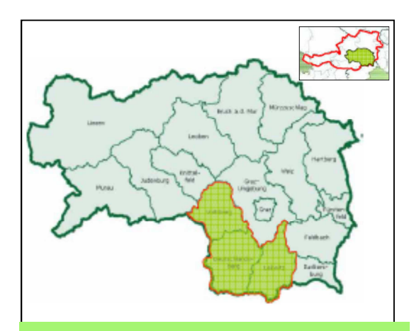
Localisation of the region in Austria and Styria

South-West-Styria consists of three administrative units (districts): Deutschlandsberg (DL), Leibnitz (LB) and Voitsberg (VO) representing 13,56% of the area of Styria.