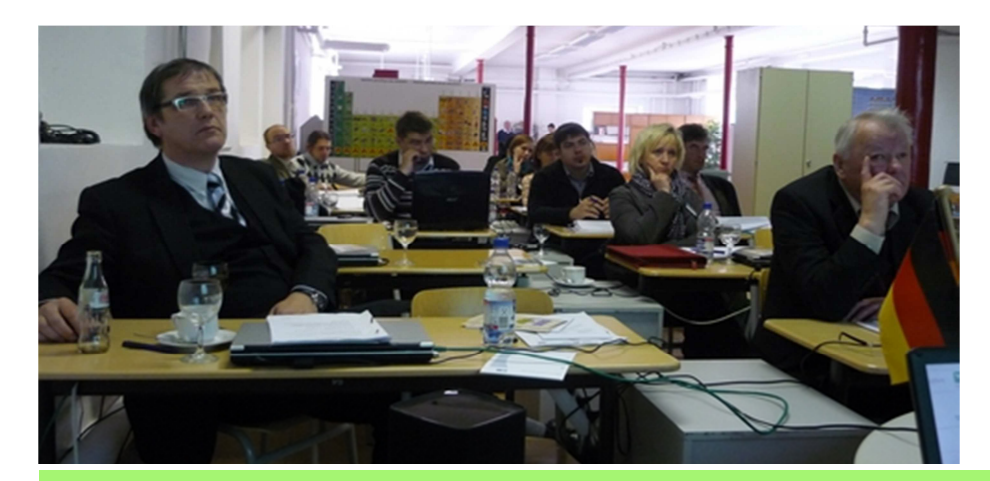
Experts and project partners at the kick off workshop in Naumburg (DE)