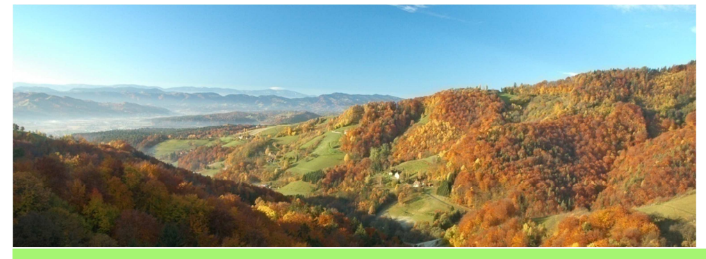
The region South-West-Styria is known for viticulture and beautiful landscapes

The history of South-West-Styria goes back to the Celts and ancient romans. For long times the region was affected by agriculture. Nowadays South-West-Styria is mainly known for their landscape and wine but also as a rising location for innovative industry.