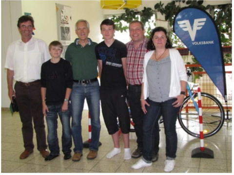
Cooperation of the company Krenhof AG and Polytechnic School Köflach - Presentation of the joint project "hub storage model"