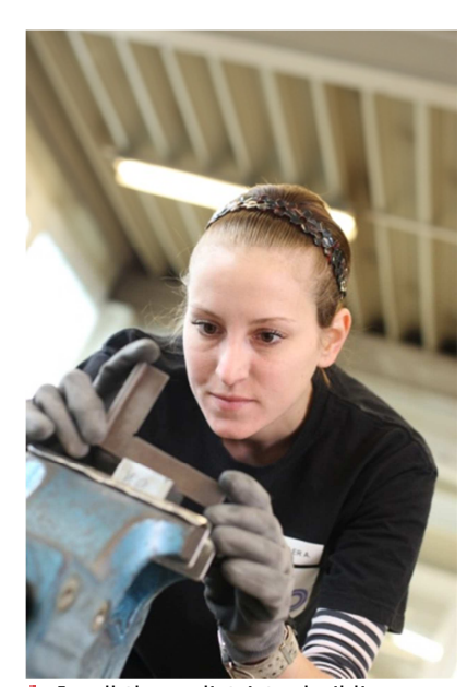
▲ In all three districts, building sector and automotive industry (Auto-Cluster Styria, ACStyria) play a decisive role in local and regional economy.

However, the economic structure changed considerably during the last years towards a more service-oriented economy. Some parts of the region focus on the development of tourism. The economic structure of the district of Voitsberg is still being dominated by its industrial and mining tradition.