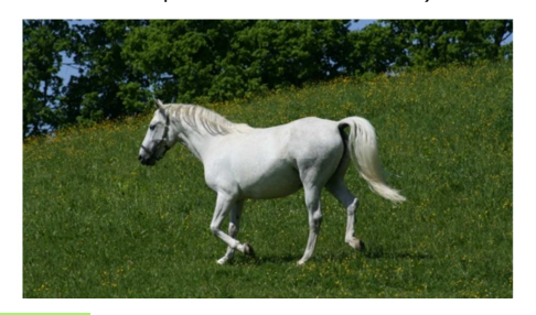
▲ Horse Breed Lippizaner

South-West-Styria consists of three administrative units (districts): Deutschlandsberg (DL), Leibnitz (LB) and Voitsberg (VO) representing 13,56% of the area of Styria.