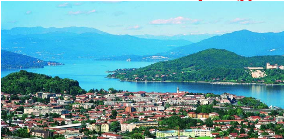
A wide view over the Maggiore lake from Arona, with the Alps in the background.