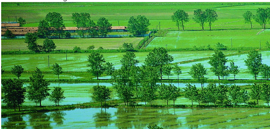
In Springtime the rice starts growing in flooded fields

Unique and worth visiting sites occupy the lands between the Lakes Maggiore and Orta: a thick network of paths rich in ancient testimonies inherited from the people who have inhabited such lands, who have strolled along them together with their animals, who have used them to trade their goods produced with great fatigue, or even to escape from the numerous wars and battles the territory has gone through; the same people who have also succeeded in modelling their environment in a respectful and wise way - unforgettable sights which reveal the natural bond between man and the territory. Whoever desires to experience and get to know these extraordinary lands has several ways to "taste" them: a walk on foot, on a horseback or by bicycle. Whatever choice is taken, one will experience "wellness to the spirit" while discovering the breathtaking aspects of an uncontaminated nature, the chiselled rocks testifying the ancient times and the numerous villages which have maintained their own cultural, sport and culinary traditions, contributing to increase the natural appeal of the lands stretching between the hills and the lakes.