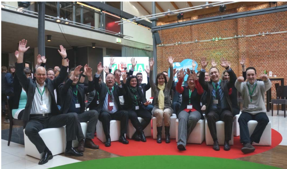
The YURA Project Partners at the Final Conference in Magdeburg

How do rural regions become more attractive to young people? At YURA Final Conference on 29 January 2013 in Magdeburg this question was in the centre of discussion.