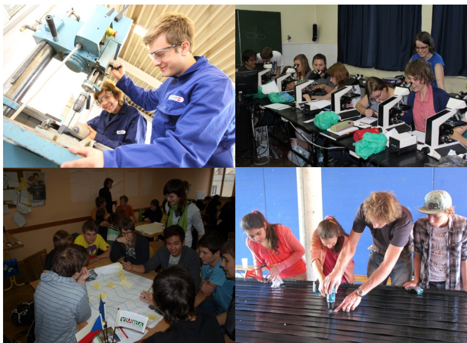
YURA pilot actions: working on the kart body, working in the chemical lab, pupils discussing the future of their region, working for solar energy

Within the YURA pilot actions, concepts to actively involve young people in educational offers were developed and tested. To obtain a clear picture of the lasting impacts in the regions and for potential future actions, the pilot actions underwent a detailed evaluation before and after implementation. The pilot actions' impact on political structures, learning cultures and cooperation processes has also been evaluated.