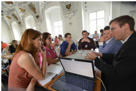
The Project partners at work

From 26 th – 29 th June 2012 the second EURUFU Consortium Meeting in Upper Styria West and Lungau took place. The variety of workshops, interesting lectures, conferences and practice showcases gave the participants the chance to produce new ideas. The four days were used for intensive work and knowledge exchange.