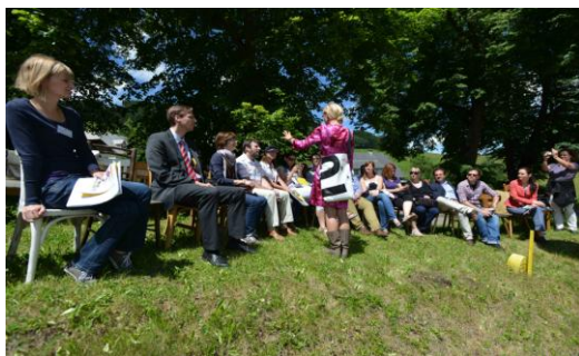
The project partners at the Regionale 12 in Upper Styria West

The partners had also the chance to visit the "Regionale 12", an art festival that deals with the topic of demographic change and migration in rural areas. On one of the most meaningful art projects you can see on the picture below. The chairs on which the EURUFUs are sitting on this picture represent the people who left the region in the past 5 years.