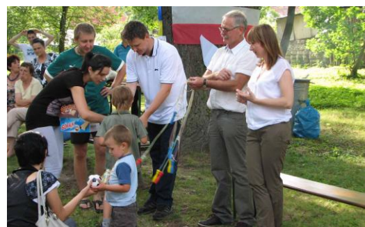
Workshop with picnic at the property of the building.

In the municipality of Brzeg Dolny a partly derelict building will be renovated to create a common room and a social recreation area in the village.