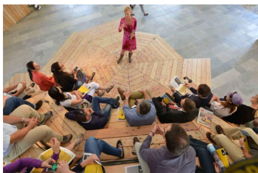
The EURUFU project partners searching for inspiration and creative ideas at the Regionale 12 in Upper Styria West

The EURUFU project is not at the period of beginning any more, it is underway and more successful than expected.