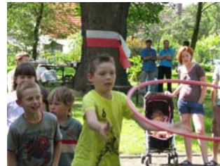
Children having fun