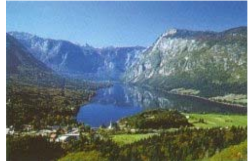
Bohinj lake, Alpines, Gorenjska

Challenges in NW Slovenia in rural areas: Having been facing a crisis situation, some areas tend to realise the importance of local economy development such as green tourism and agriculture with local food production that can lead to create new job opportunities in rural areas.