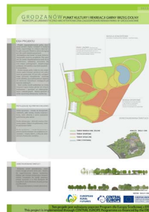
Best conception, as chosen by the inhabitants