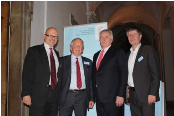
Federal Minister for Social Affairs of Austria Rudolf Hundsdorfer (2 nd from right) participated at the Symposium in St. Lambrecht, Austria,